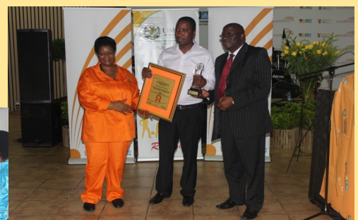
MEC Congratulates yet another winner for best reporting public body : Department of Roads and Transport.