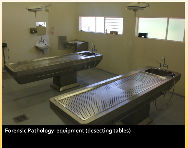
Forensic Pathology equipment (desecting tables)