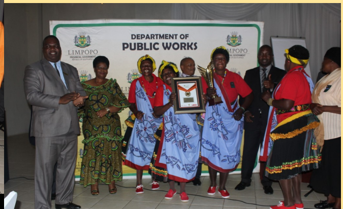
Ladies from Giyani cost center dancing in celebration after receiving the award for best support service delivery