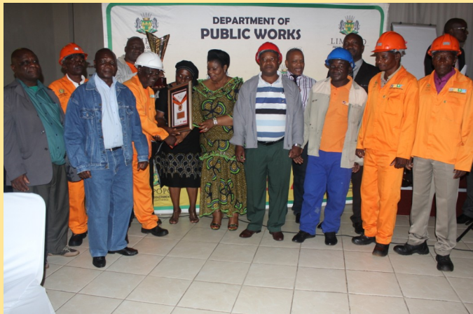
Winners from Tzaneen Cost Centre receiving their Awards from the MEC, HOD and CFO.