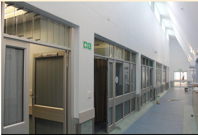
Inside view of gynecology ward

Limpopo Department of Public Works continues to be a leader in the provision and management of government land and buildings. The department on behalf of the department of Health delivered an Administration block, Library, Outpatient Department (OPD), construction of X - Ray section in the Letaba Clinic, Gynecology ward and renovated the nursing college center and 17 residential houses for nurses at Letaba Hospital.