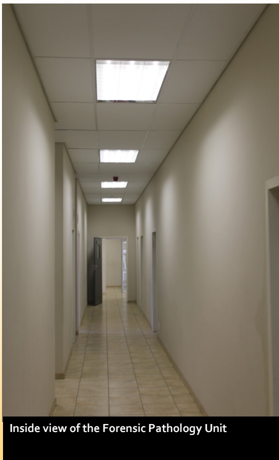
Inside view of the Forensic Pathology Unit