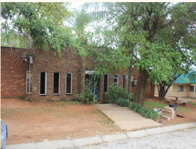
Before: Administration block