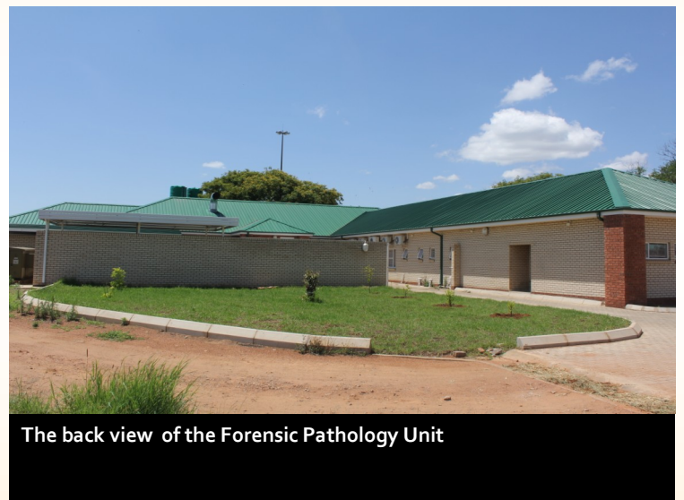
The back view of the Forensic Pathology Unit