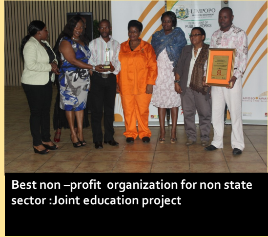
Best non –profit organization for non state sector :Joint education project