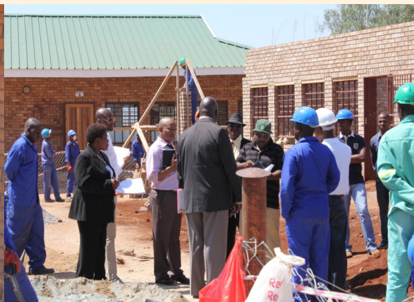
The members engaging with the workers at Majjane Primary School.