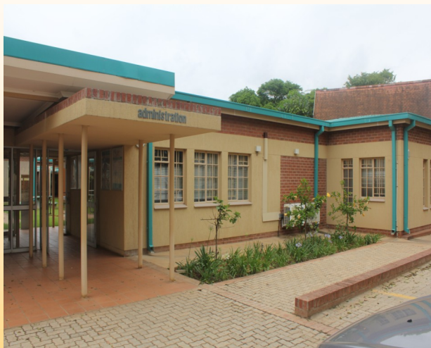
After: Administration block