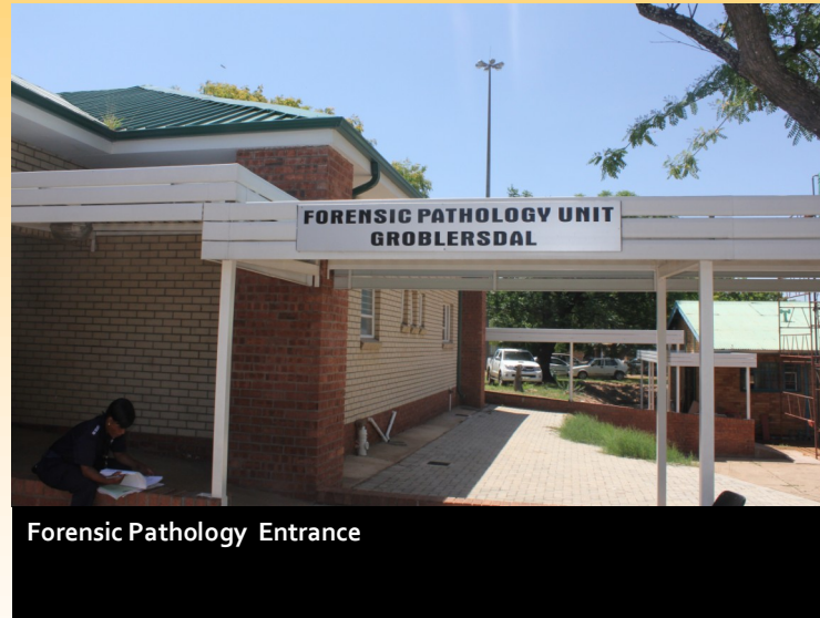
Forensic Pathology Entrance

The aim for this construction was accessibility for the community. The community was previously using a contracted private mortuary of St. Ritas hospital which is far and inconvenient for some communities in Groblersdal. The Forensic Pathology is fully equipped with all the necessary and required equipment to provide services.