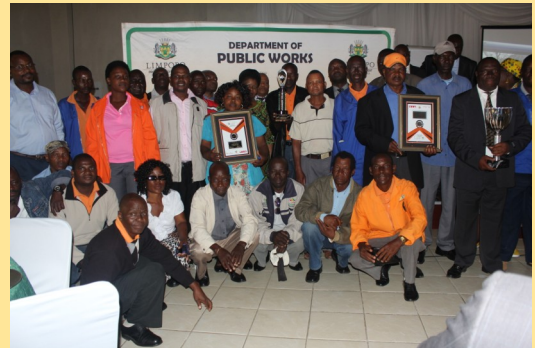
Lulekani Cost Centre winners

The department congratulates all the nominees and the winners, keep it up !!