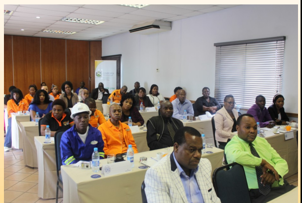
Attendees at the ceremony