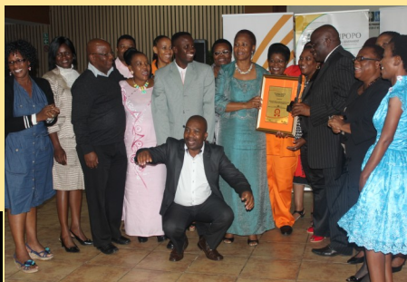
Special category award was awarded to the social sector .