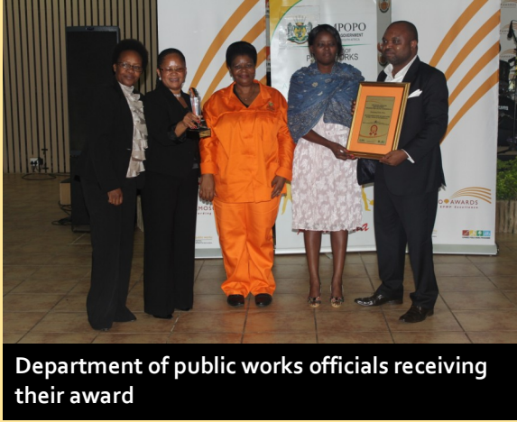
Department of public works officials receiving their award